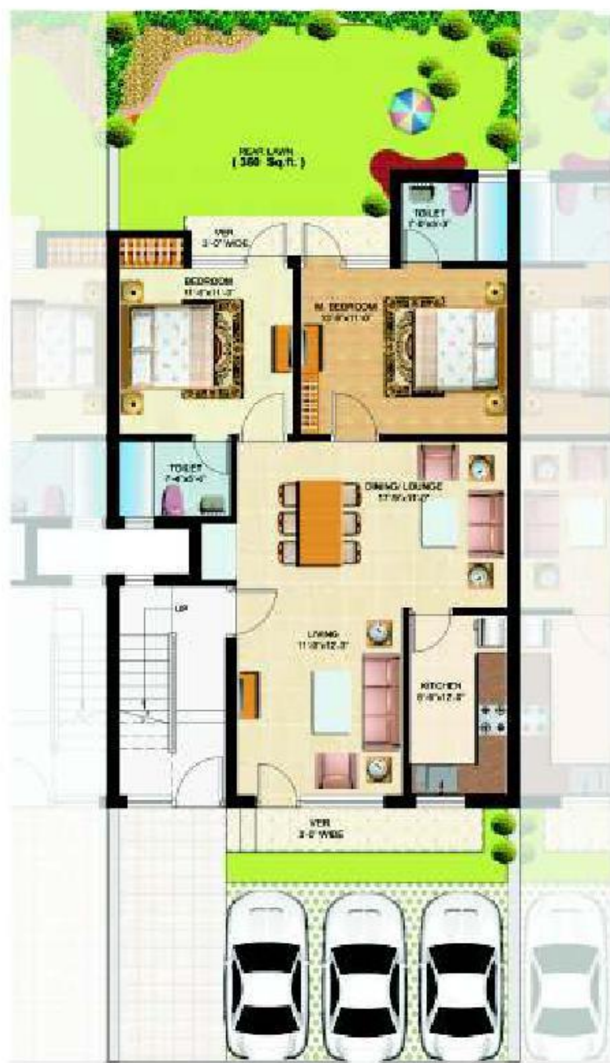
GROUND FLOOR PLAN ( SUPER AREA = 1150 SQFT )