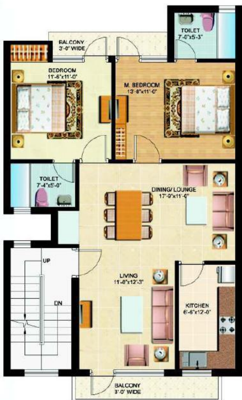
1ST & 2ND FLOOR PLAN ( SUPER AREA = 1150 SQFT )

Note: Lawn area will be provided to the owner of GF 60% terrace rights will be provided to the owner of SF