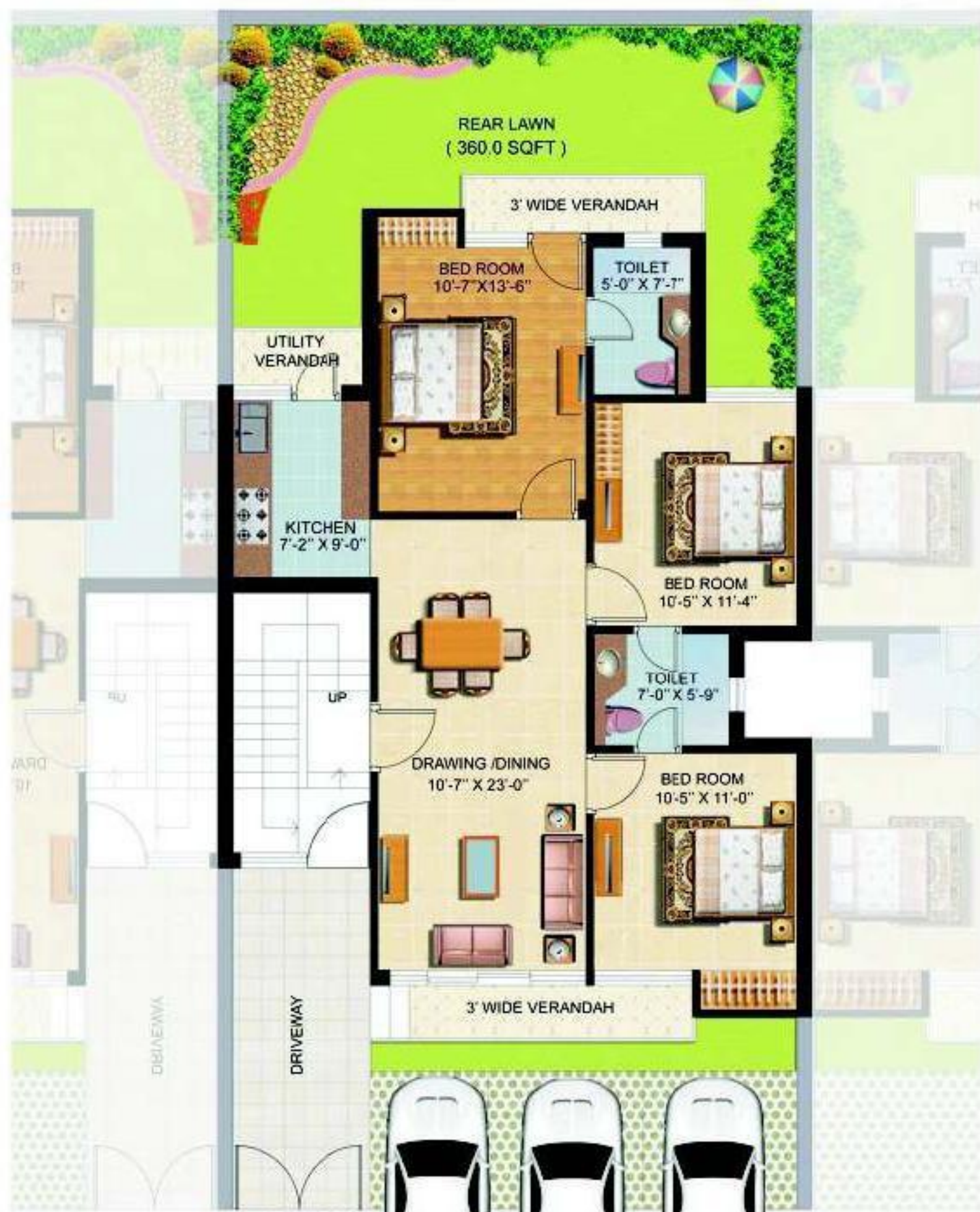
GROUND FLOOR PLAN ( SUPER AREA - 1150 SQFT )