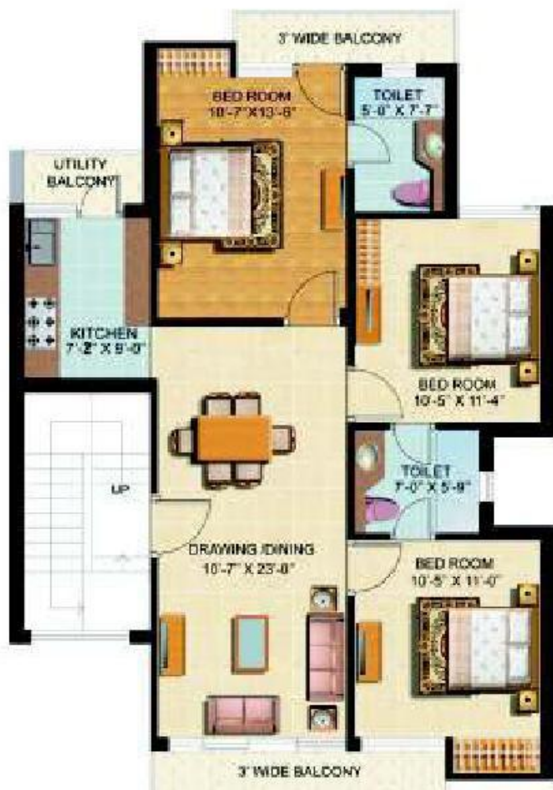
1ST & 2ND FLOOR PLAN ( SUPER AREA - 1150 Sq.ft.)

Note: Lawn area will be provided to the owner of GF 60% terrace rights will be provided to the owner of SF